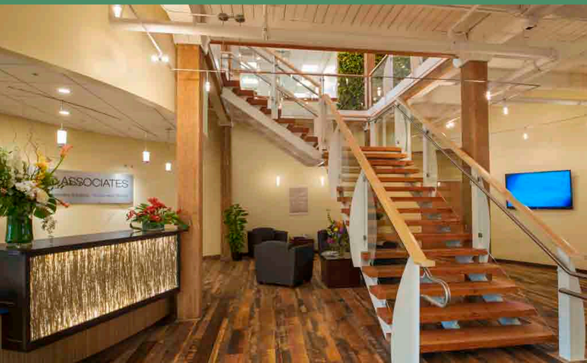
Central spaces for collaborative work define the core of the office space.